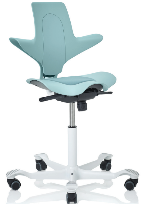
Design: Peter Opsvik. Patent- and design protected.