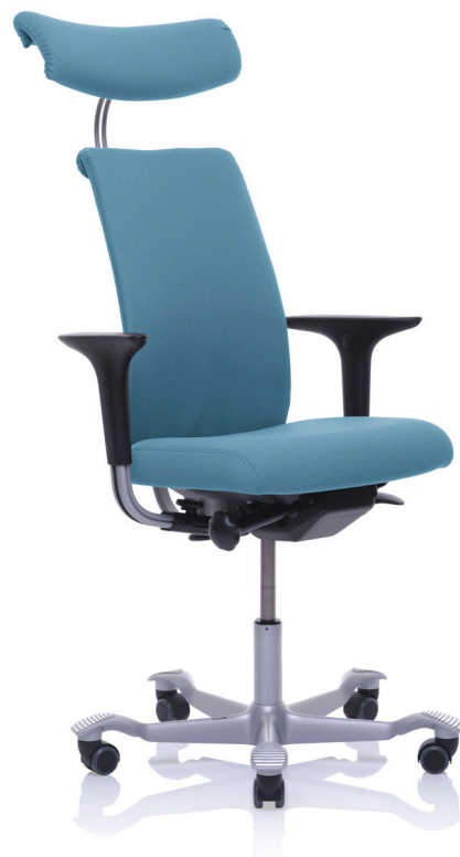
Design: Peter Opsvik. Patent- and design protected.

AWARD FOR DESIGN EXCELLENCE NORWEGIAN DESIGN COUNCIL