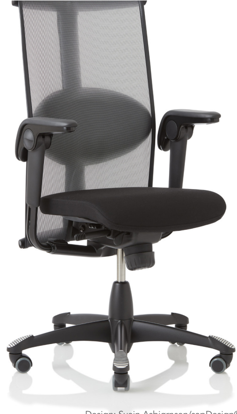
Design: Svein Asbjørnsen/sapDesign®. Patent- and design protected.