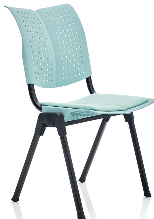
Design: Peter Opsvik. Patent- and design protected.