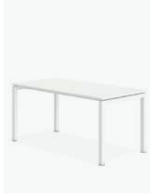
6850/63 - Boxter 160 x 80x 75 cm