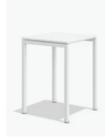
6860/13 - Boxter 80 x 80 x 110 cm